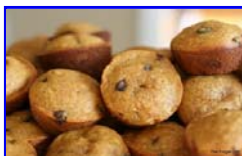
• Pumpkin Chocolate Chip Muffins

Copyright © 2010 NewLafayette.org . All Rights Reserved.