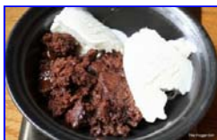
• Hot Fudge Pudding Cake