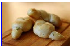
• Home made Garlic Knots