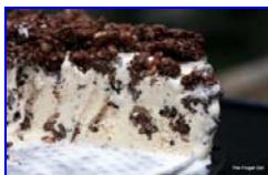
• Ice Cream Crunch Cake