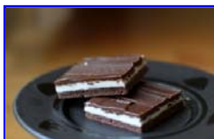
• Chocolate Parfait Bars