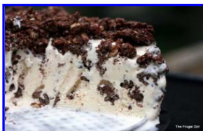
Ice Cream Crunch Cake