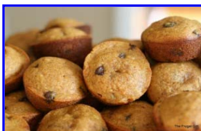
Pumpkin Chocolate Chip Muffins