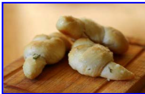
Home made Garlic Knots