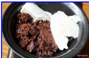
Hot Fudge Pudding Cake